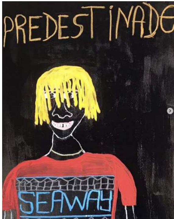
JAMEX O cria predestinado , 2022 50 x 80 cm | 20" x 32" PVA, enamel and oil pastels on canvas