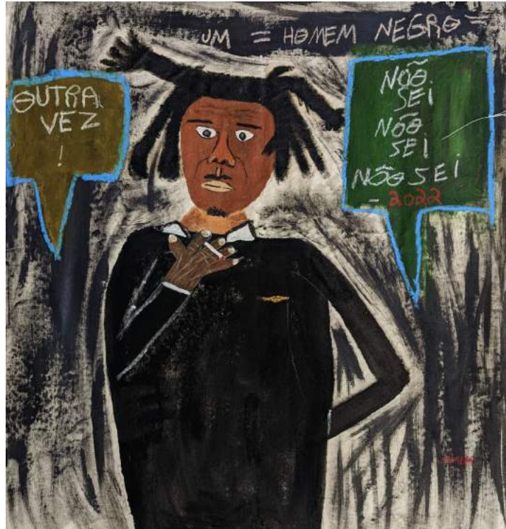
JAMEX Jean-Michel , 2022 84 x 84 cm | 33" x 33" mixed media on canvas