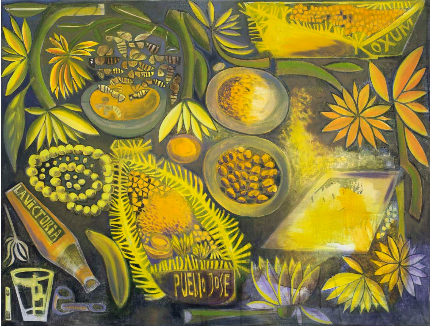
Ofrenda Oxum , 2022 acrylics and oil on canvas 95 x 122 cm