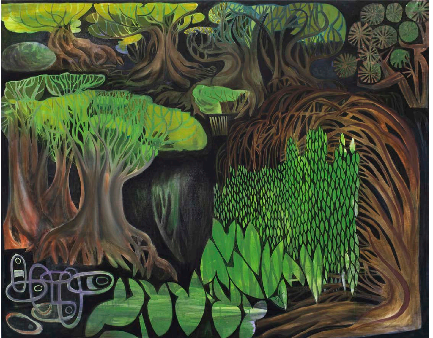
Bosque alegre , 2022 acrylics and oil on canvas 157 x 197 cm