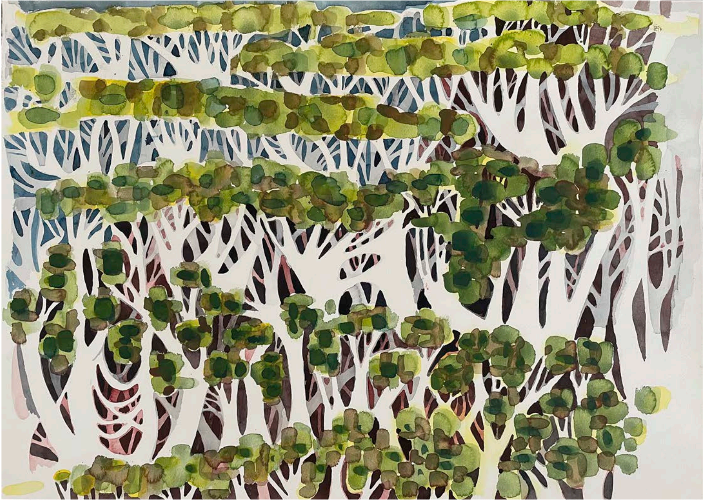
Cerros, febrero , 2014 watercolour on paper 50 x 70 cm