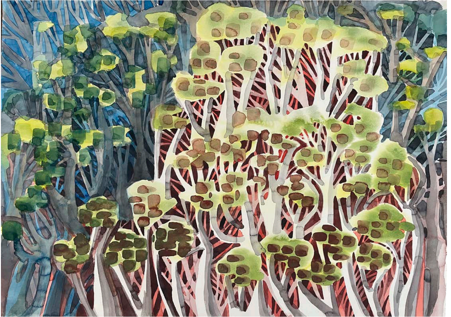
Cerros, marzo , 2014 watercolour on paper 50 x 70 cm