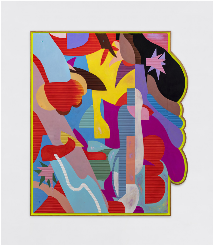
avaf: Parada Vertical , 2024 Acrylic on duplex sheet of corrugated kraft paper 204 x 172 x 4 cm | 80 3/4 x 67 3/4 x 1 1/2 inch

Step into the world of avaf at Art Dubai 2024, where art transcends boundaries and imagination knows no limits. Join Baró Galeria in celebrating the transformative power of creativity and the enduring allure of color.