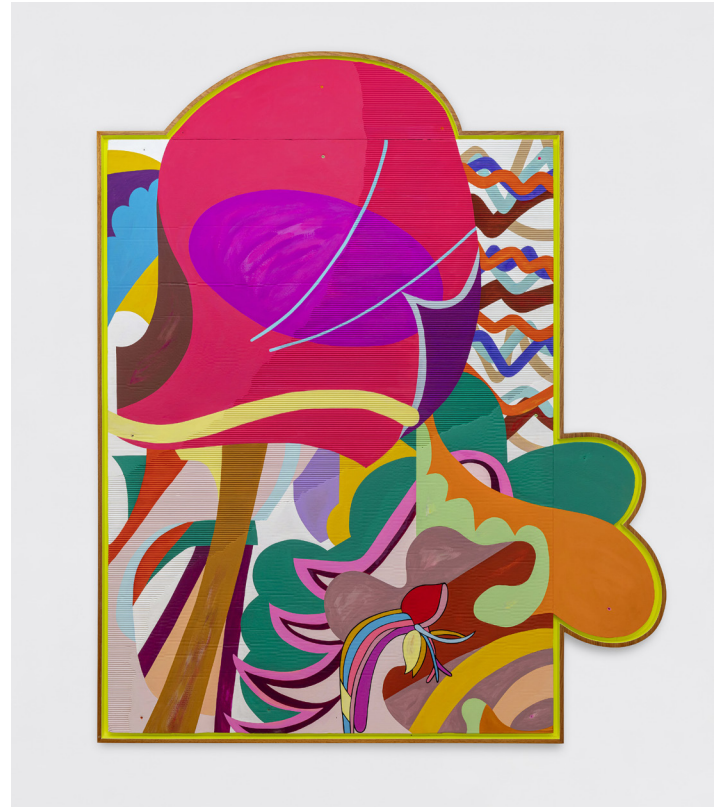
avaf: Sempre Cabeçada , 2024 Acrylic on duplex sheet of corrugated kraft paper 232 x 188 x 4 cm | 91 3/4 x 74 x 1 1/2 inch