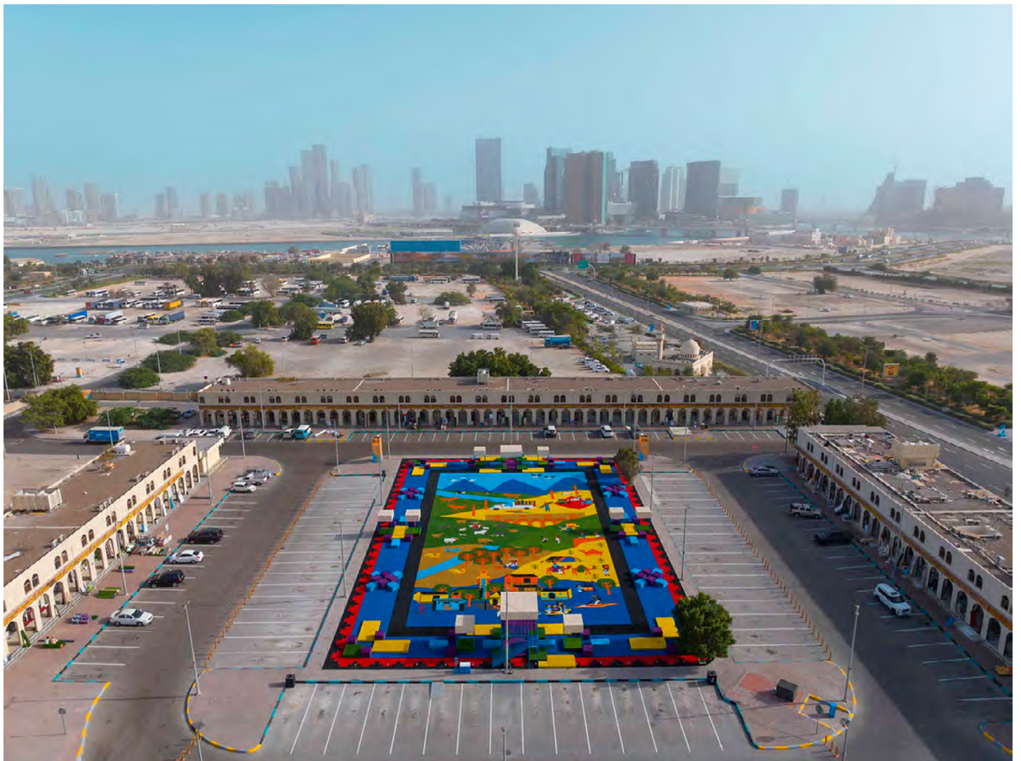
"Where Lies My Carpet is Thy Home" Where Lies My Carpet Is Thy Home. 2024. Astroturf. 66 x 42 meters. Commissioned by the Department of Culture and Tourism Abu Dhabi for the Public Art Abu Dhabi Biennial 2024.

The Obligation of the Circle will open on November 21, 2025, from 6:00 PM to 11:00 PM, coinciding with Gallery Night at Abu Dhabi Art 2025, and will remain on view until March 13, 2026.